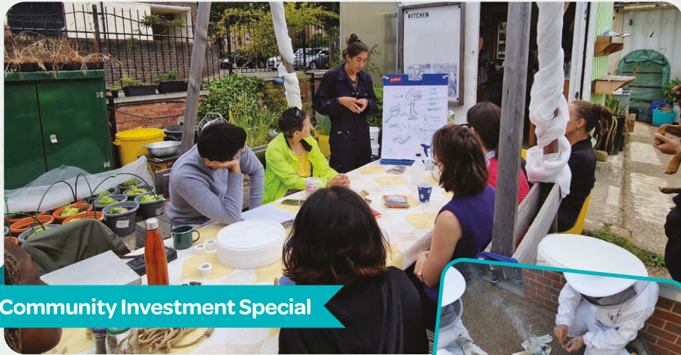
Community Investment Special