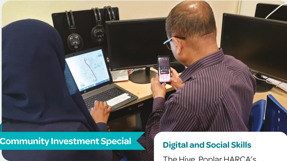
Community Investment Special