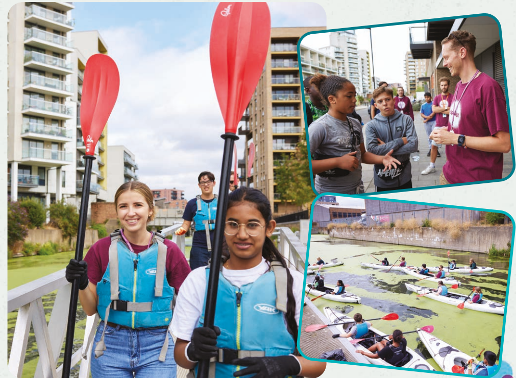
Local Young Person

"It was fun helping clean up the canal and getting to do canoeing at the same time."